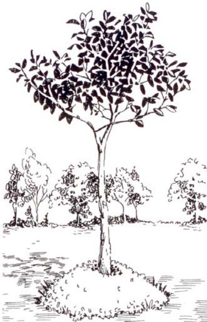
"Mulch volcanoes" cause many problems for trees.

MULCH MUST BE APPLIED PROPERLY; if it is too deep or if the wrong material is used, it can actually cause significant harm to trees and other landscape plants.