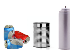
Metal Cans Aluminum, Steel, Tin