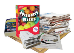
Paper Products & Cardboard

NOT Accepted for Recycling: Plastic bags, trash bags, cassette tapes, bed sheets, hangers, chains, hoses, batteries, buckets, car parts, chemicals, clothes, cords, cups, dishware, electronics, hazardous items, light bulbs, needles, pots, pans, ropes, toys, tubs, window glass,