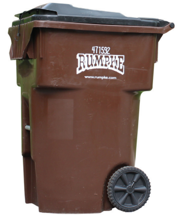
95-Gal. Trash Cart