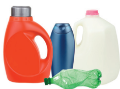
Plastic #1-7 Bottles & Jugs

Combine the items below unbagged in your recycling container.