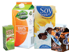
Cartons & Aseptics