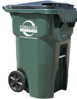
65-Gal. Recycling Cart